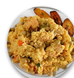
Rice with chicken